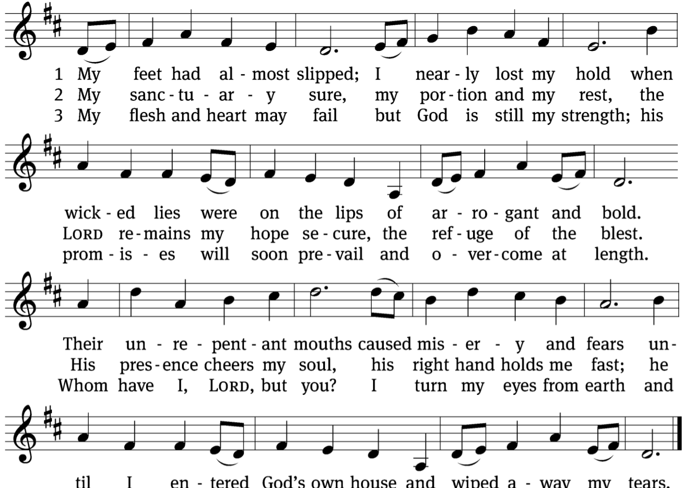
til I en - tered God's own house and wiped a - way my tears. guides my path with his con - trol, takes me to heav'n at last. seek those things which, good and true, a - lone have price - less worth.